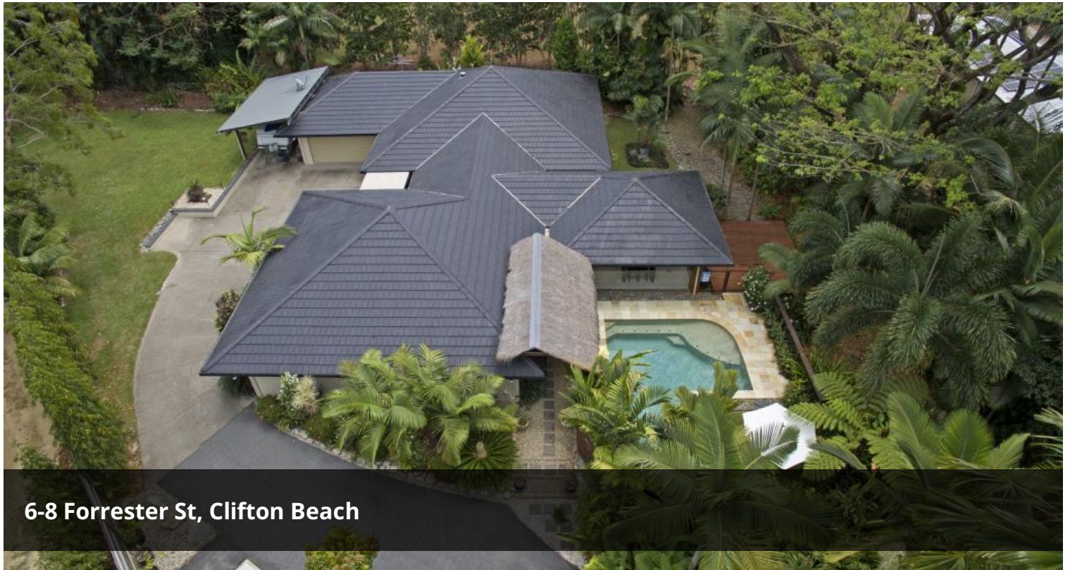
6-8 Forrester St, Clifton Beach