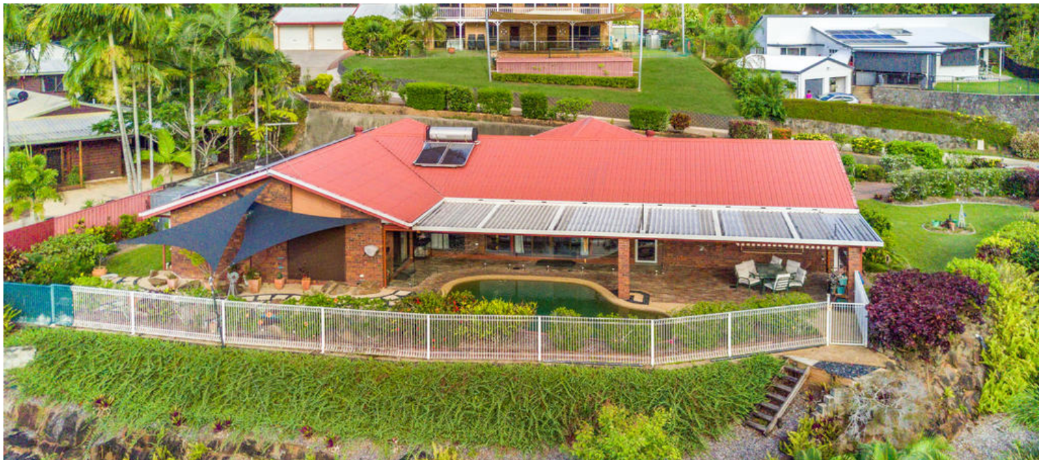
8 Dove Ct, Bayview Heights